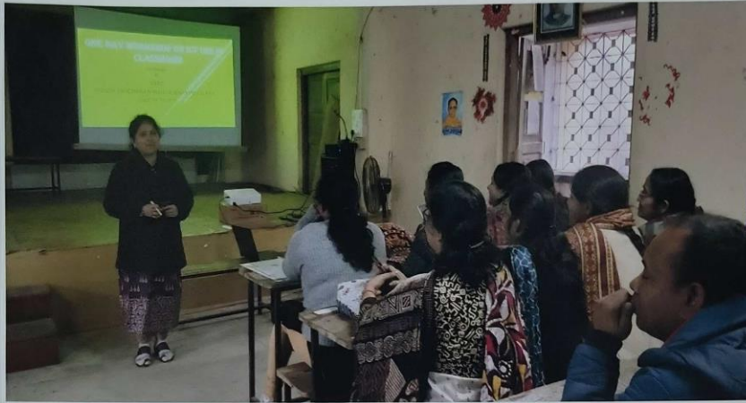
One Day Workshop on ICT Use in Classroom Date: 11/01/2019 Place: Seminar Hall, TPMM. TIC is speaking on the necessity of ICT.

COOCH BEHAR (WB) INDIA PIN : 736101 Phone No. & Fax No. : 03582-222695 E-Mail : tpmm_cob@rediffmail.com Mobile : 6295861623 (Principal)